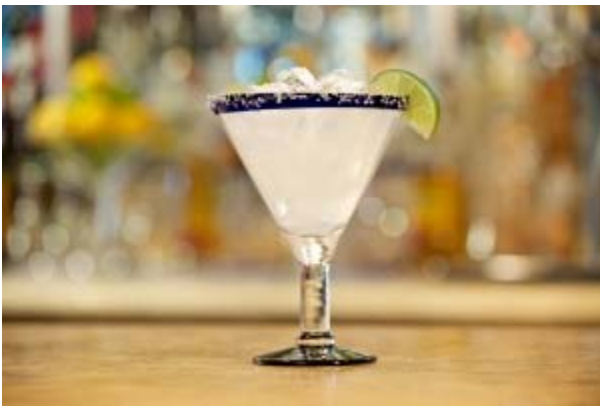
Margarita - Cantina LAREDO

many times i point out that the a sign of a good restaurant is how the staff handle the situation if you don't like something or once you have made a complaint. i told them that we were